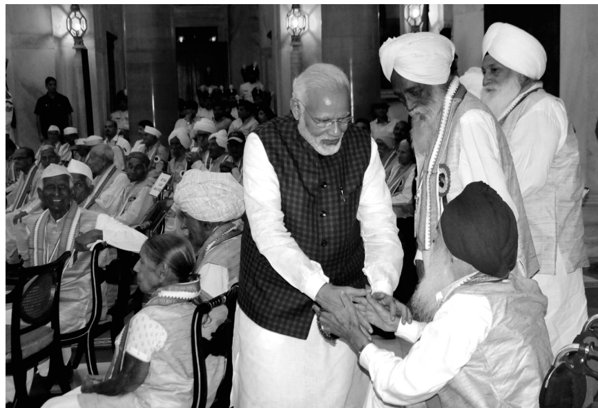
Prime Minister Narendra Modi greet freedom fighters during a reception organised at the Rashtrapati Bhawan in New Delhi on Wednesday. — G.N. JHA

The Air India plane has been grounded temporarily and the national carrier will be claiming damages from the Ethiopian airlines. The Ethiopian airlines issued a statement, saying, "On August 9, 2017, our B-767 aircraft, registration number ET-AMG, preparing for a regular Delhi-Addis Ababa bound flight, number ET687, had a minor ground incident of wing tip collision with Air India A320 aircraft during push-back at the IGI Airport.