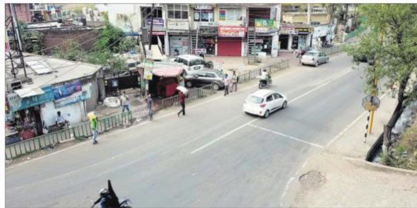
The Baddi-Nalagarh section of the National Highway-105.

"Around 400 of 649 acquired structures have been evaluated till now and the process to evaluate the remaining ones is underway. A compensation of Rs 26.71 crore has been paid for the structures acquired at 13 villages of Saraj Majra Lanana, Kishanpura, Manpura, Belikhoh, Dhana, Khera Chak, Juddy Khurd, Tah Wali, Khera Nihla, Rakh Ram Singh, Dadi Bhola, Nalka and Kirpalpur on May 25.