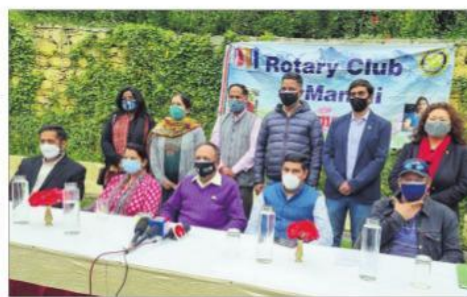
Rotary Club office-bearers during a press conference in Manali.

He thanked the Rotarians, who offered their services to collect the donations. He said the technical aspects of the project would be looked