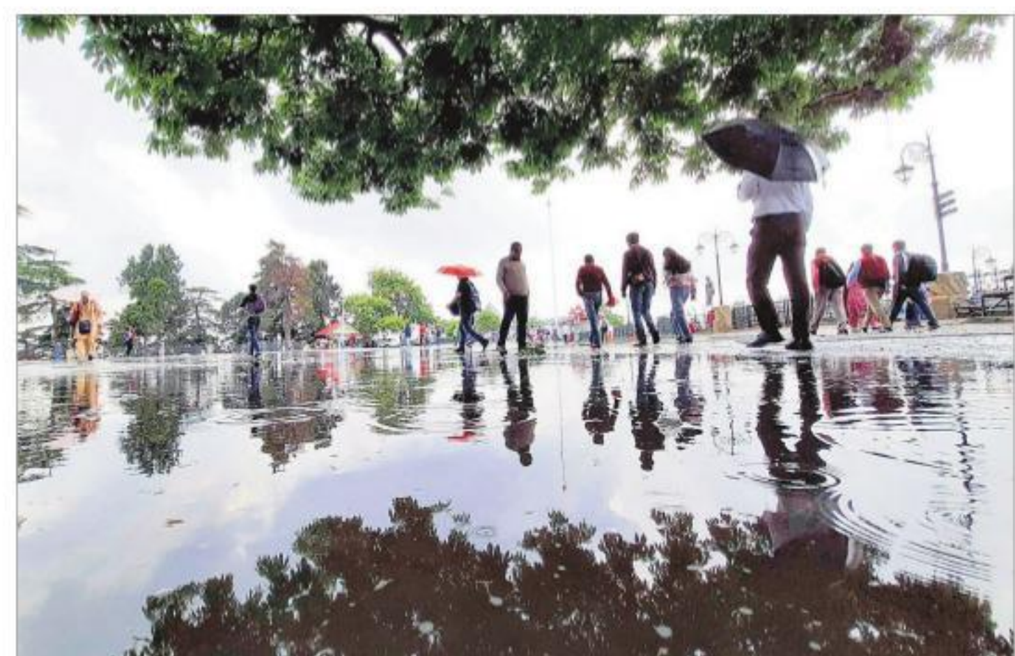
People enjoy a stroll during the rain in Shimla on Tuesday.